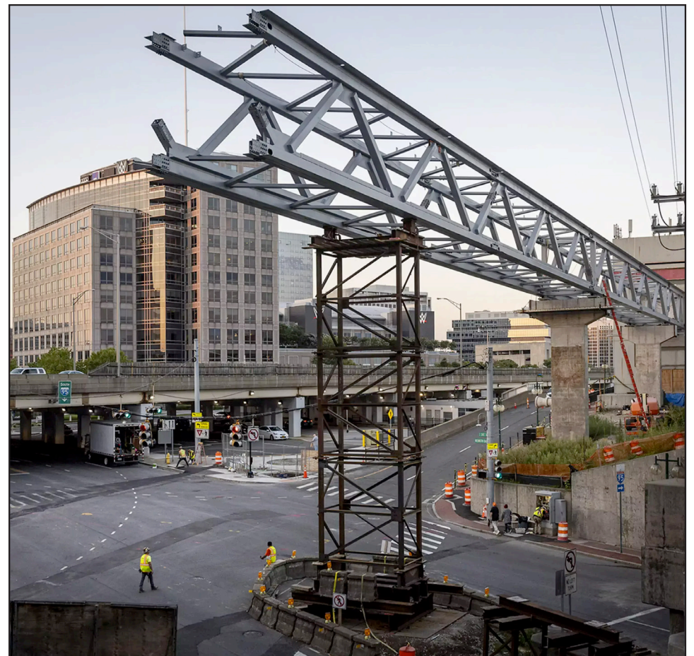
Construction of a federally funded bridge in Stamford, Connecticut.